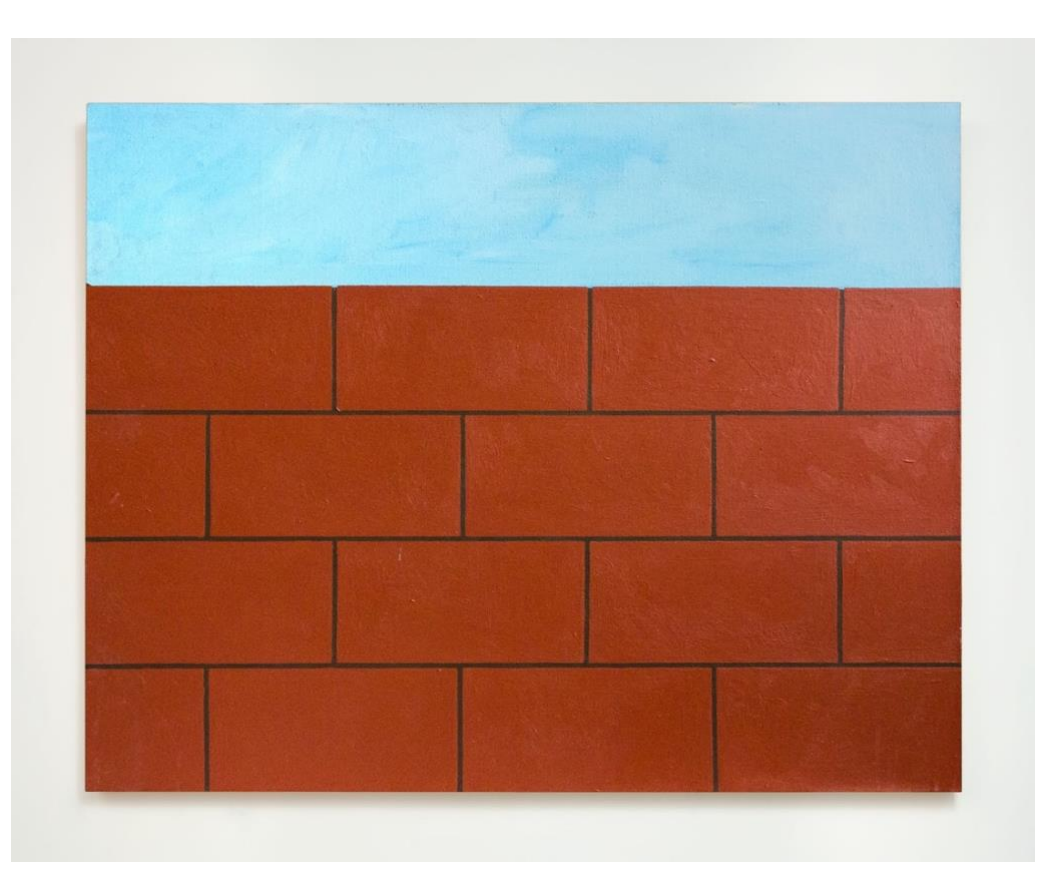
Peter Halley, Red Wall, 1980. Acrylic on canvas, 27 1/2 x 35 inches