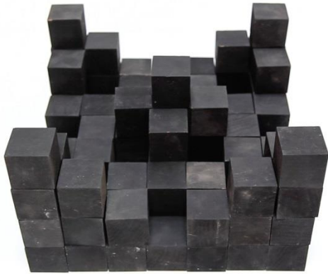
Serial Sculpture E , 1966 84 wooden blocks painted black 12¼ x 12¼ x 7 inches